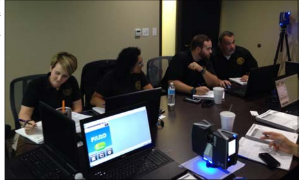
OSBI CSI agents learn to use the FARO

To our knowledge, the only other agencies using this technology in Oklahoma are the Office of the Chief Medical Examiner and the Oklahoma City Police Department.