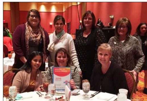
OSBI Human Resources Unit Honored

Currently, Oklahoma ranks 45 on America's Health Rankings (2015). Our poor health outcomes are hurting our families, finances, and future. With that said, FOCUS 5 hopes to continue its efforts in providing the resources and setting examples of improving our personal and agency wellbeing through the FOCUS 5 food pantry program, on-site educational seminars and immunization clinics, wellness challenges, and recycling program. FOCUS 5 also hopes to expand its efforts to other surrounding agencies.