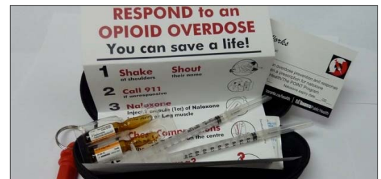
Opiate Antagonist Kit

OSBI requested the bill due to forensic analysts often handling highly toxic opiates. It is possible an analyst could become exposed and die without immediate medical attention in the form of an injection of an opiate antagonist such as Naloxone or Naltrexone. This new law allows for that. OSBI forensic analysts have been trained on how to properly use the drug. OSBI has numerous laboratories across the state. Each one will be equipped with an opioid overdose kit. The law goes into effect November 1, 2017.