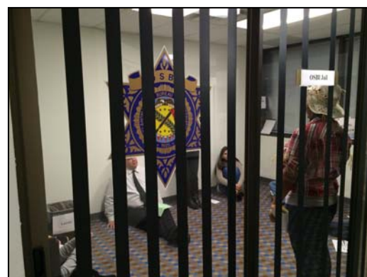
Jail and Bail raised several hundred dollars for the charity campaign

This year, the OSBI exceeded its fundraising goal, raising a total of $12,310. “The 2015 campaign was a huge success. The SCC Committee really